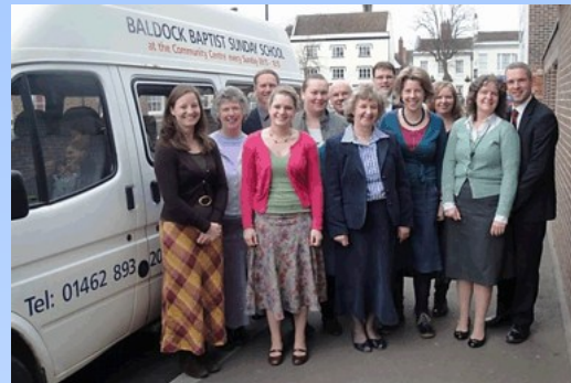
Sunday School Staff

Baldock Sunday School Community Centre, Simpson Drive, Baldock SG7 6DH